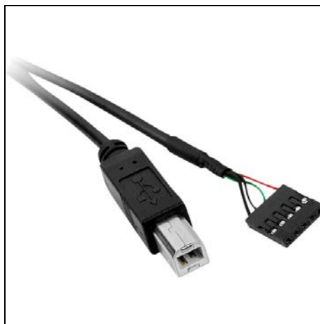
Figure 2: 1x5 pin header socket connector

Another option for the reader interface is the 1x5 pin header socket, where the cable shown in Figure 2 is to be used for connecting to the motherboard of the computer, instead of the USB cable.