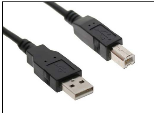
Figure 1: USB A/B cable for ACR38F-A1

The size is the same as a standard 3.5-inch floppy disk drive and there is no plastic cover on top. There are also screw holes on the reader for mounting the device on the computer chassis. For convenience, four (4) pieces of PA 2.6 mm x 8 mm screws are included. A “4-pin mini power socket (M)” is provided on the PCB reader for the power interface (the socket is the same as the one used in a 3.5-inch floppy disk drive) on which the included USB A/B cable, shown in Figure 1 , is to be used for connecting the reader to a USB port on the host computer.